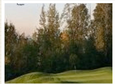
LANGARA GOLF COURSE