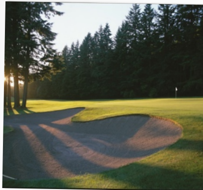
UNIVERSITY GOLF CLUB