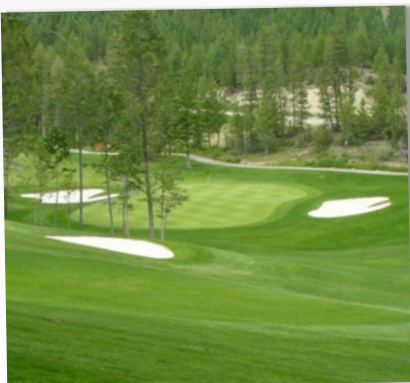
THE RIDGE AT COPPER POINT