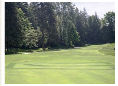
FRASERVIEW GOLF COURSE

Starting at $10,500 plus HST Send us an email and we will send you the details