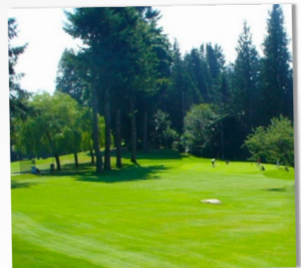
GLENEAGLES GOLF COURSE