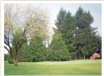
GREENACRES GOLF COURSE